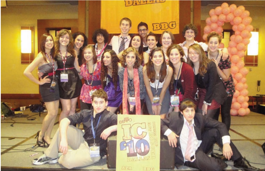
Nineteen Canadian delegates, who travelled from Toronto, Winnipeg, Calgary and Edmonton, were among 800 teens from eight countries attending the B'nai B'rith Youth Organization's International Convention in Dallas, Texas.

The weekend was originally headlined by the Day of Service, in which teen participants would disperse throughout Dallas to more than two dozen service sites, but plans changed due to inclement weather. Instead, the teens participated in an advocacy simulation, choosing an issue of importance about which to lobby 'Congress' and then find out whether they were success-